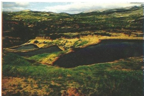
Fig.1 • Group of evaporation basins on sloping fields

According to the evaporation basins method the olive vegetation water produced by the oil factories is conducted by means of plastic pipes either by natural flow or pumping in open water-tight basins constructed in some distance from the factory. (Fig. 1). Vegetation waters plus the rainfall within the basins are subjected to natural evaporation by means of the solar energy. When the evaporation is terminated a solid material consisting of the organic and minerals material contained to the vegetation waters is concentrated at the bottom of the basin (Fig.2). This solid material, rich in organic and mineral material is used as a fertiliser for olive orchards or as a fuel in the oil factory.