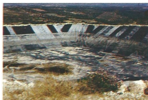
Fig.4. Evaporation basin with plastic film on the bottom

An other important factor for a well functioned evaporation basin is its dimensions and particularly its surface area which has to be calculated to insure the finish of the evaporation at least before the middle or end of the next summer.