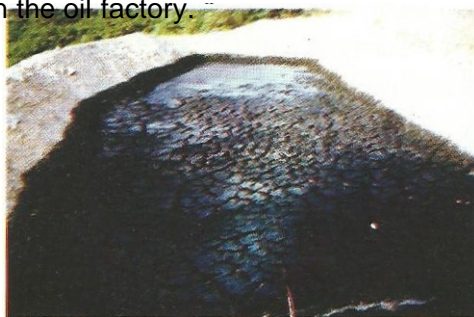
Fig.2. Evaporation basin with the residual solid material

A right constructed evaporation basin has to be completely impermeable in order to avoid the infiltration of the waste waters to the deeper soil layers and the consequent pollution of the underground waters. For this reason impermeable soils (Fig.3) have to be chosen or artificial impermeable material (plastic films or cement) have to be used on the bottom of the basin (Fig.4).