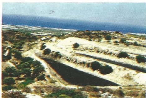
Fig.3. Evaporation basins on calcareous impermeable soils

A right constructed evaporation basin has to be completely impermeable in order to avoid the infiltration of the waste waters to the deeper soil layers and the consequent pollution of the underground waters. For this reason impermeable soils (Fig.3) have to be chosen or artificial impermeable material (plastic films or cement) have to be used on the bottom of the basin (Fig.4).